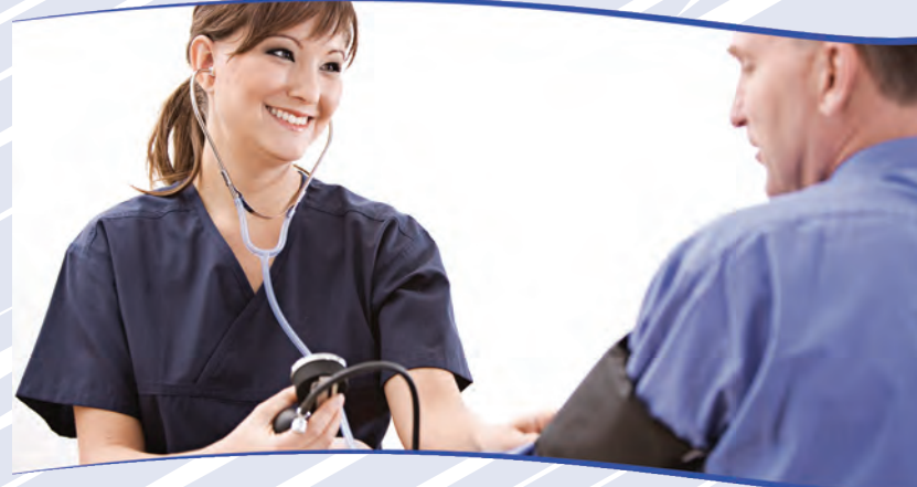
World Diabetes Day