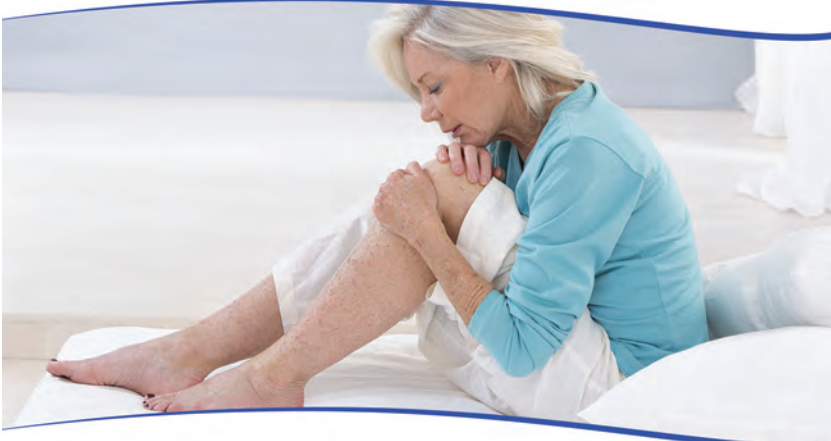
International Athritis Day