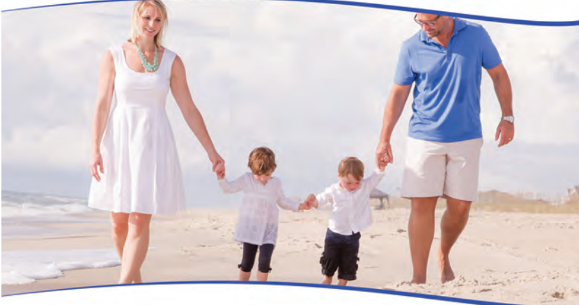
International Family Day