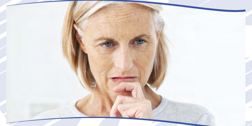
World Alzheimers Day