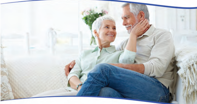
Week of Older Persons