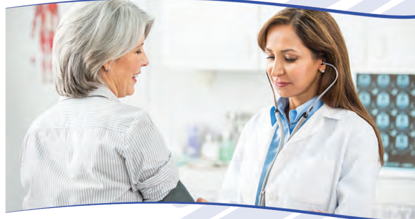
World Hypertension Day