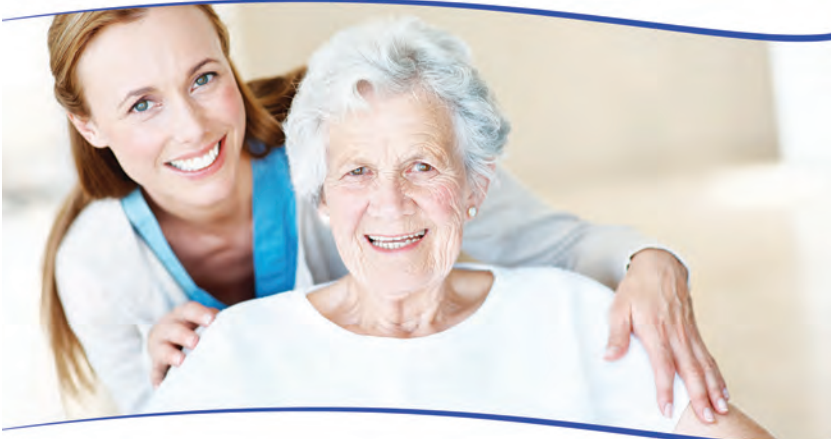
World Eldery Abuse Awareness Day