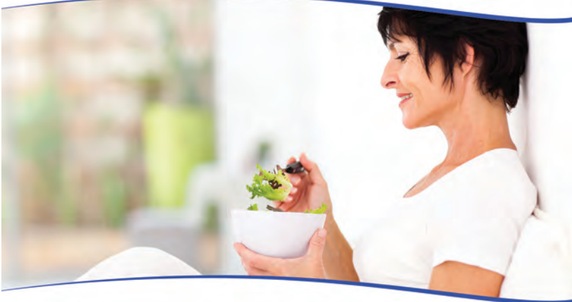
World Health Day