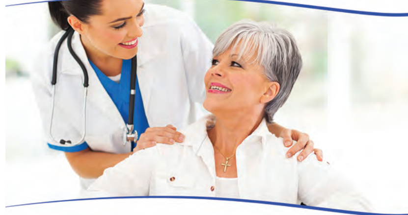
World Parkinsons Day