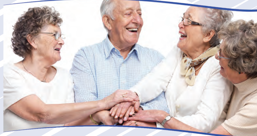
International Older Persons Day