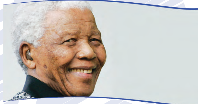
Nelson Mandela Day