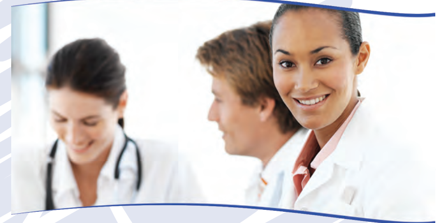
World Nurses Day