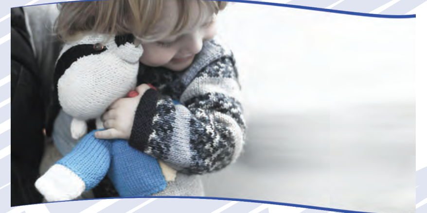
Pretty Things 4 Little Things