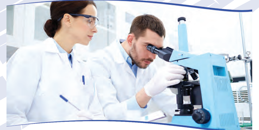
World Aids Day